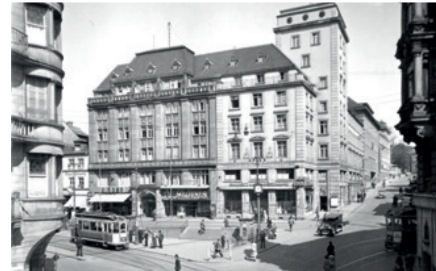
The Pforzheim industrial building in 1938

1958 The members of the jewellery association decide to change the name to “Industrieverband Schmuck und Silberwaren e. V.”. (ISS). Its task: to protect the interests of its members at local, state and federal level. The association becomes a member of the Association of Federal Associations of the German Jewellery and Silverware Industry.