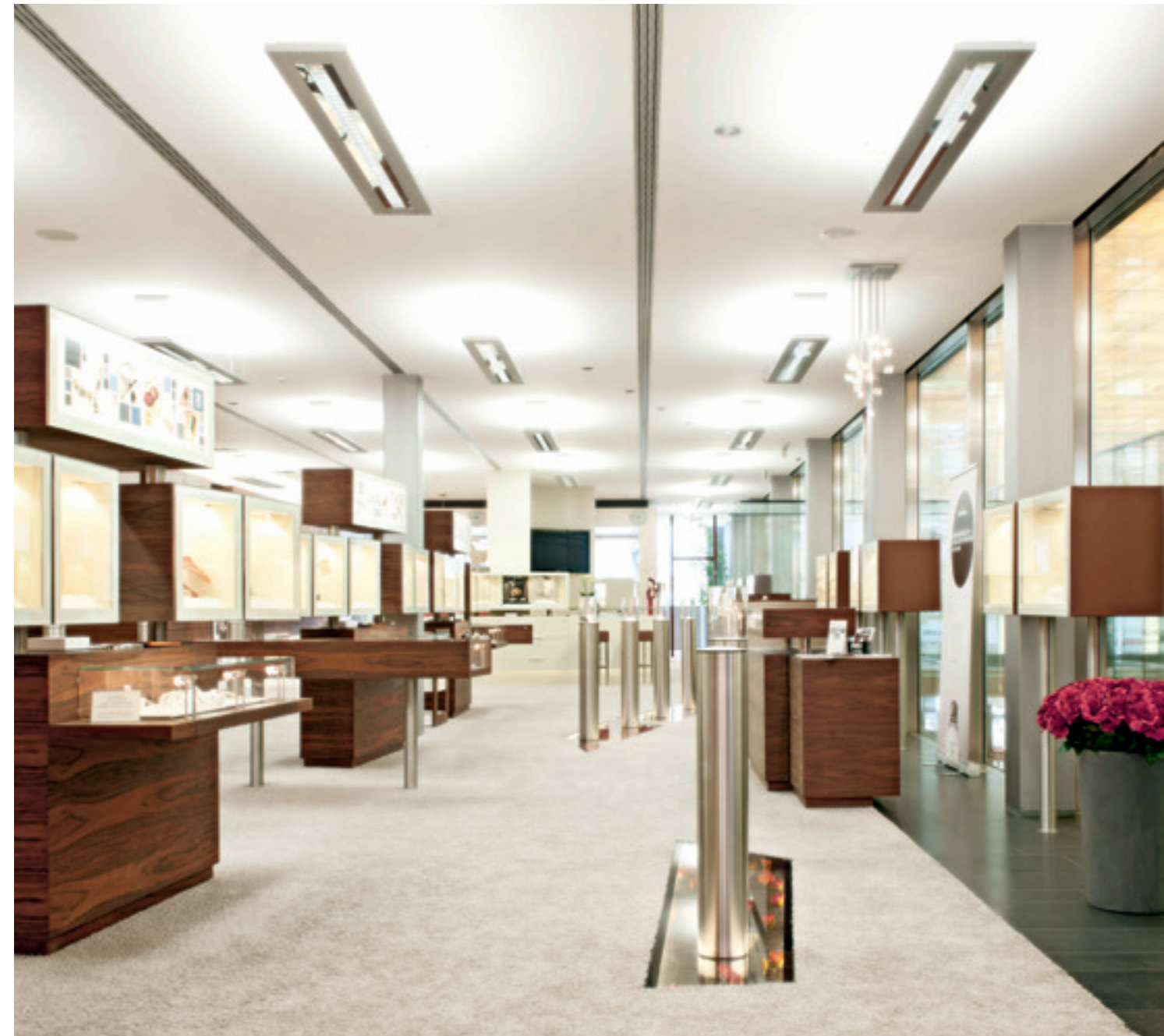
Exhibition area of Deutsche Schmuck- und Uhren GmbH